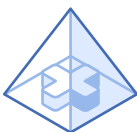
Centralized DR Management

Organizations are under increasing pressure to provide always-on availability of applications and services. Meeting these expectations calls for an IT resilience strategy which protects against unexpected disruptions that can take services offline and disrupt business operations. Organizations must employ a disaster recovery (DR) strategy that does not merely protect data, but also provides fully automated failover and an ability to routinely test recovery plans.